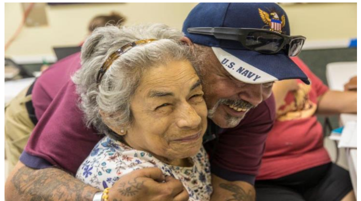
FEMA staffer helping a survivor in Refugio, TX.

If you need legal assistance due to Harvey, call the Young Lawyers Division of The American Bar Association at 800-504-7030. Survivors can receive free counseling on insurance claims, landlord-tenant issues, home repair contracts, foreclosures, replacement of legal documents destroyed or damaged by the storm and other legal matters.